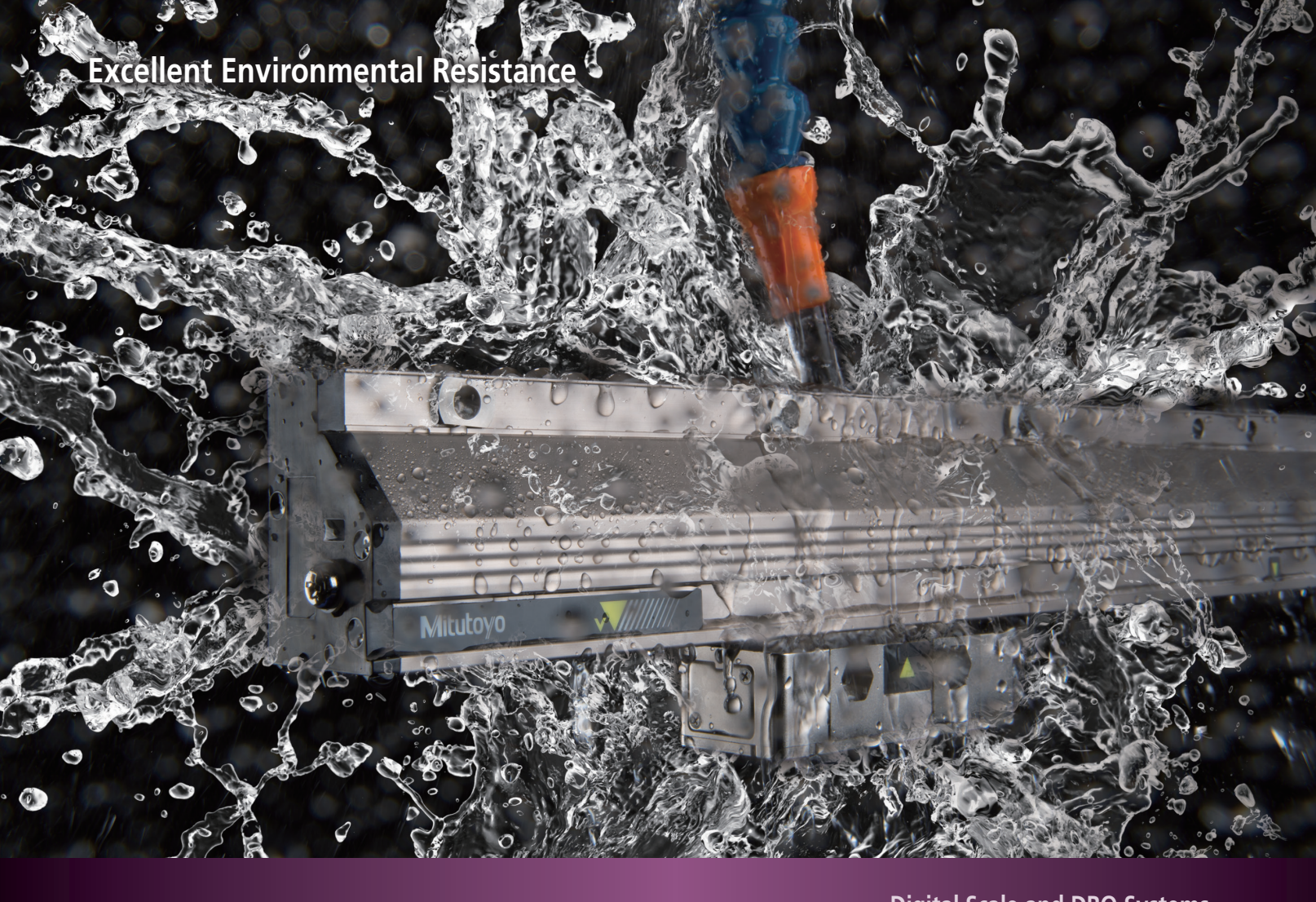
Digital Scale and DRO Systems